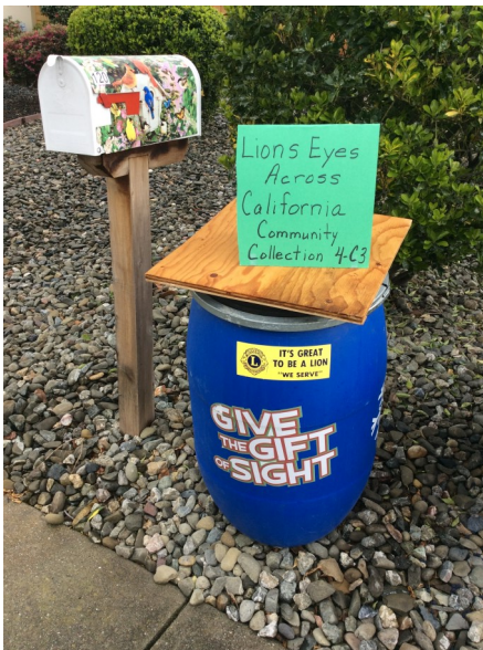
photo attached of barrel in front of the Langhorst's used for eyeglass collection.

Held a crab feed, donated back packs to Trinity Center, held a speakers contest, collected eyeglasses and worked at Lions In Sight Warehouse...We participated in "Lions Eyes Across California."